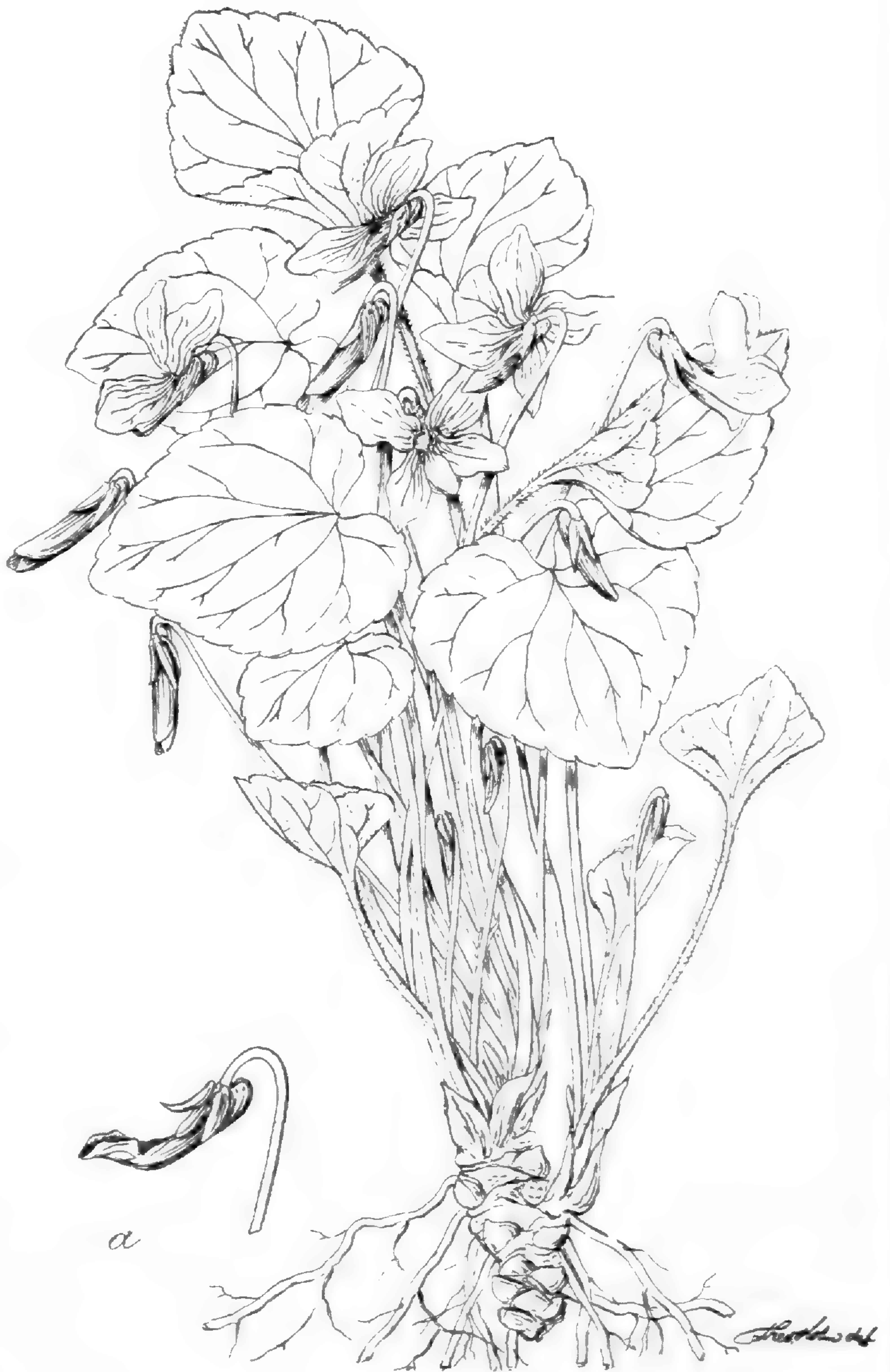
VIOLA PAPILIONACEA, Pursh.